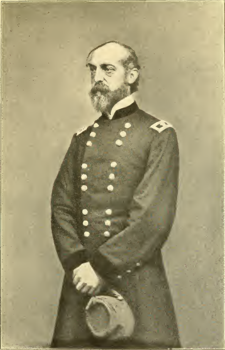
GEORGE GORDON MEADE